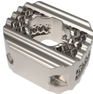
Figure 1 Fortilink®-C with TiPlus™ Technology

Further copies of the surgical technique and instructions for use can be requested at the distributor.