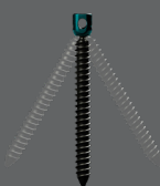
POLY-AXIAL CLOSED TULIP